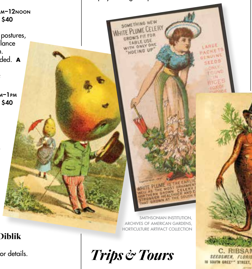
SMITHSONIAN INSTITUTION, ARCHIVES OF AMERICAN GARDENS, HORTICULTURE ARTIFACT COLLECTION

Nineteenth-century seed companies distributed humorous illustrated trade cards depicting vegetables with human features to advertise their businesses. This exhibition displays enlarged reproductions of these cards.